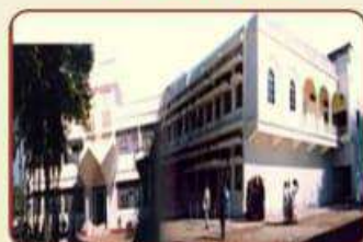
S. K. Porwal College